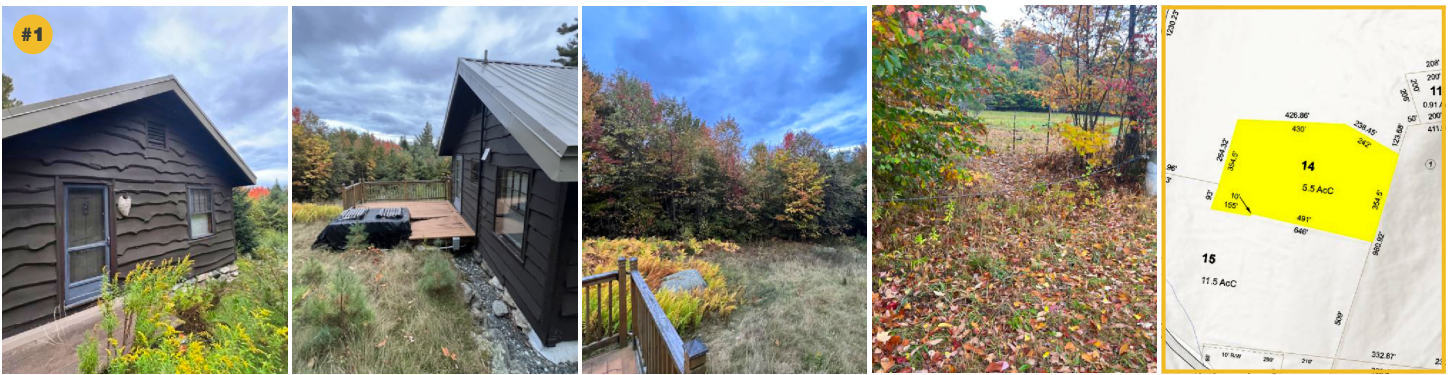
713 Lewis Hill Road, TM 411-14

5.50± acre lot with a 1-bed, 1-bath cottage-style house in good condition. Mountain views. Parcel also contains two sheds, a one-car garage, electricity, whole-house generator, propane tank, furniture, washer/dryer, and various yard equipment. Parcel is accessible via a right-of-way road over adjacent property. A special property for a private getaway!